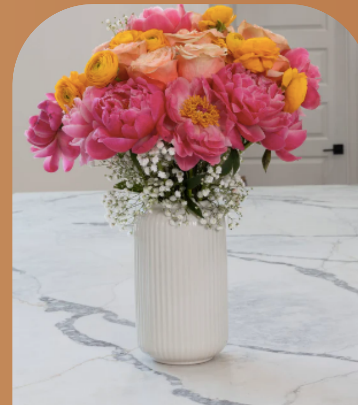
joy blooms flower delivery subscription From $75.00 USD

This turn-key package is for new businesses that want to hit the industry with a distinct brand identity, customer persona profiles, and the digital channels you need to convert customers.